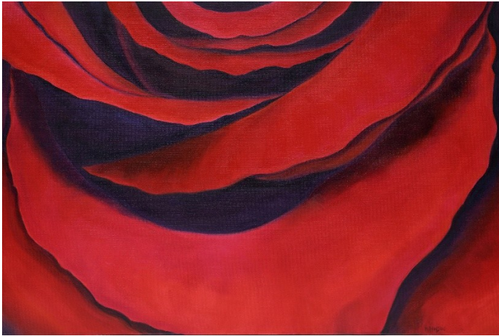
Red Rose I; $1,800 Oil on canvas; 20"H x 30"W; 2024