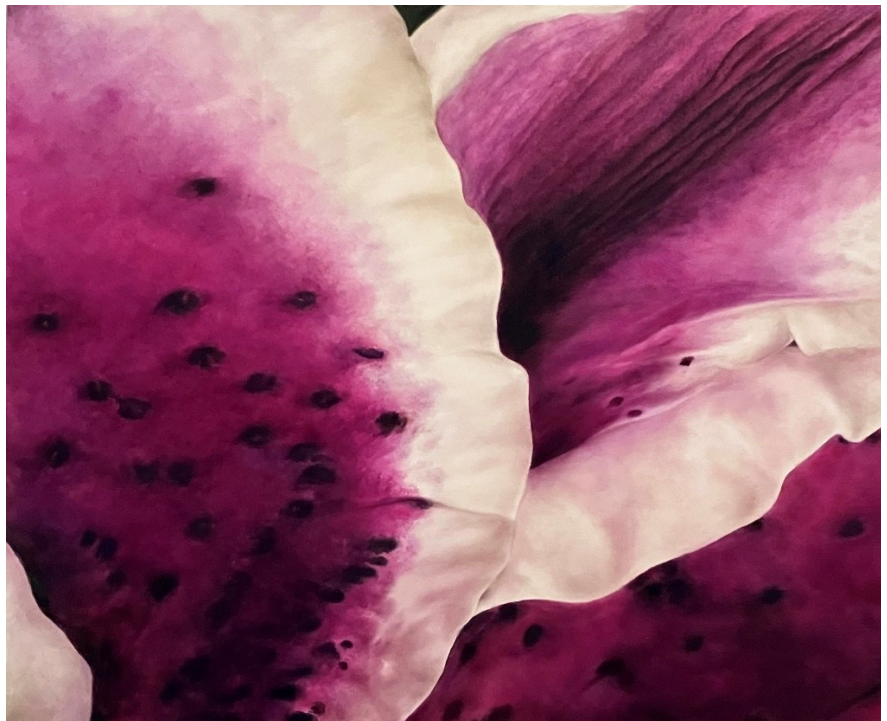
Stargazer Lily (A Friend's Garden); $3,200 Oil on canvas; 30"H x 40"W; 2024