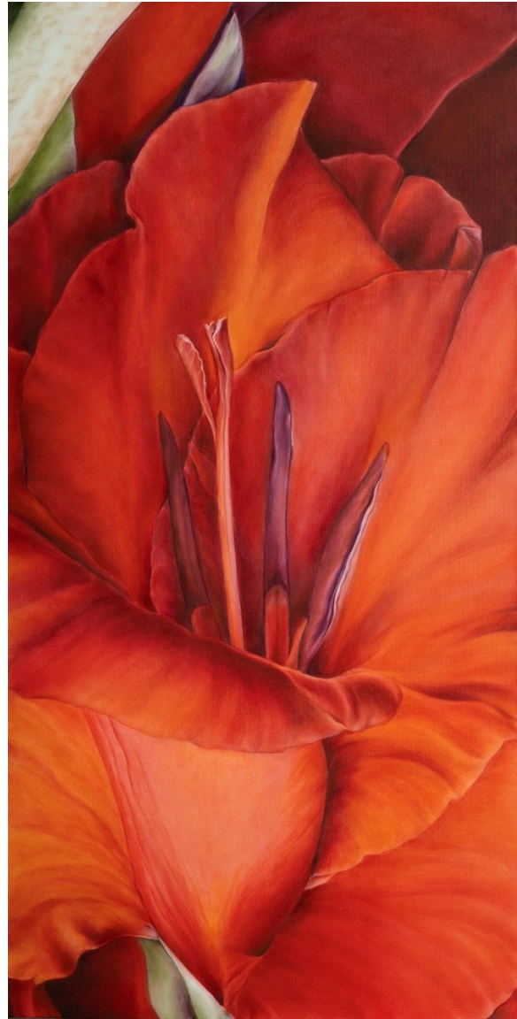
Gladiola ; $4,200 Oil on canvas; 48"H x 24"W; 2025