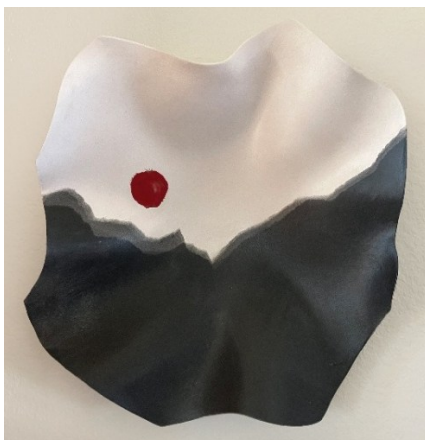
Red Sun Over Berkshires; $300 Ceramic; 16.5"H x 15.5"W x 4.5"D; 2004

Artwork available for private viewing and immediate acquisition. Contact a Gallery Associate for details.