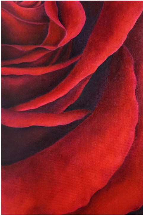
Red Rose II ; $1,800 Oil on canvas; 30"H x 20"W; 2024