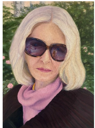
Artist in Rose Garden (Musée de Picasso/Paris); $1,500 Oil on canvas; 22"H x 16"W; 2024