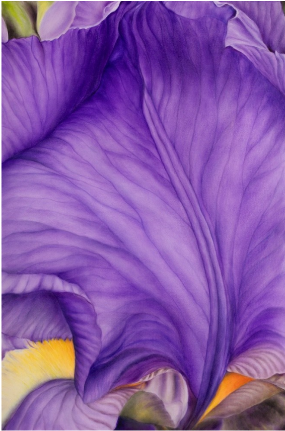
Iris in Paris (Les Tuileries); $3,800 Oil on canvas; 36"H x 24"W; 2025