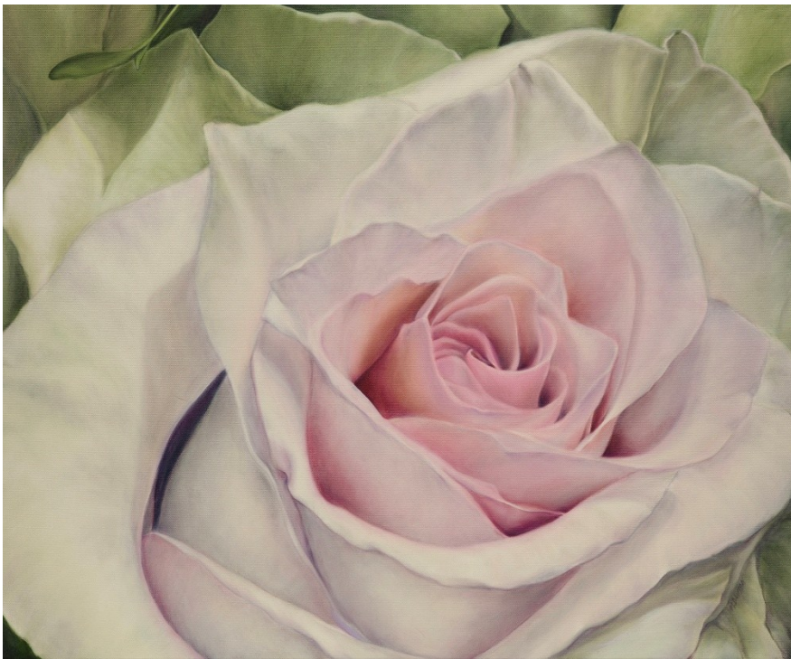
Rose in Bloom; $3,800 Oil on canvas; 30"H x 40"W; 2025