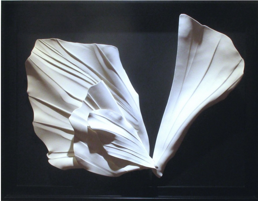
Winged Victory ; $1,600 Ceramic, mounted in frame; 27.25"H x 35"W x 3"D; 2007