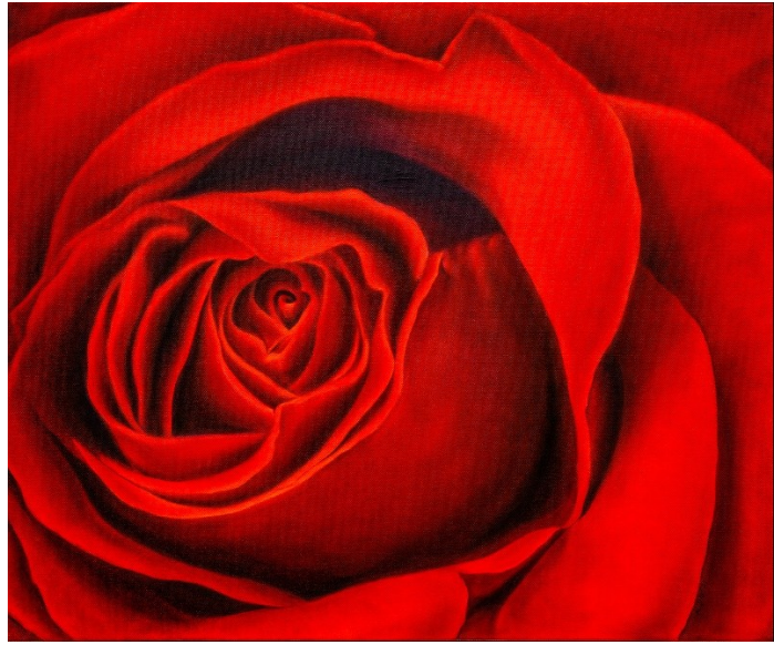
Red Rose III ; $3,000 Oil on canvas; 24"H x 30"W; 2024