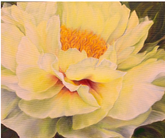
Yellow Peony (Simpson Garden Park); $3,200