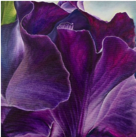
Black Iris (From My Garden) ; $2,000 Oil on canvas; 20"H x 20"W; 2024