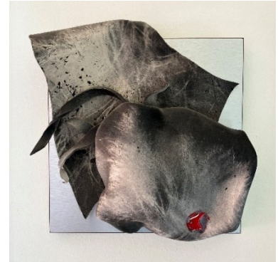
Dreamscape ; $200 Ceramic, aluminum base; 13"H x 13"W x 5"D; 2007