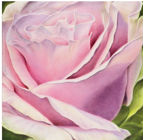
Pink Rose II; $2,200