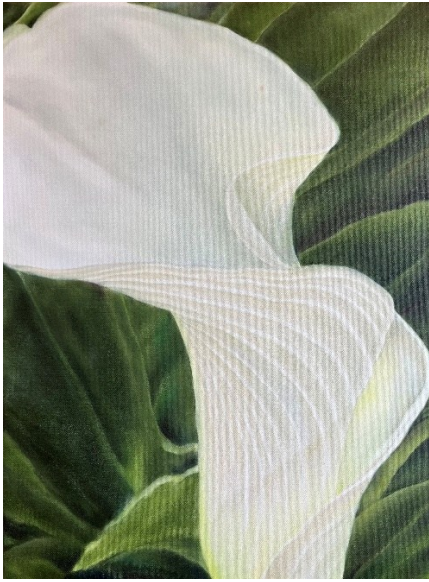
Lily ; $1,850 Oil on canvas; 24"H x 18"W; 2025