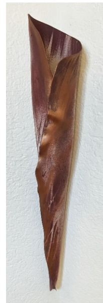
Quiver I; $200 Ceramic; 22.25"H x 4"W x 4"D; 2018