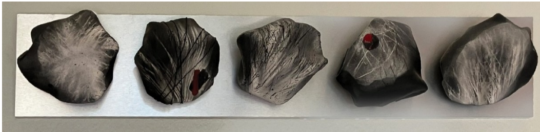
Five Pillows I; $1,200 Ceramic, aluminum base; 8"H x 42"W x 4.5"D; 2006