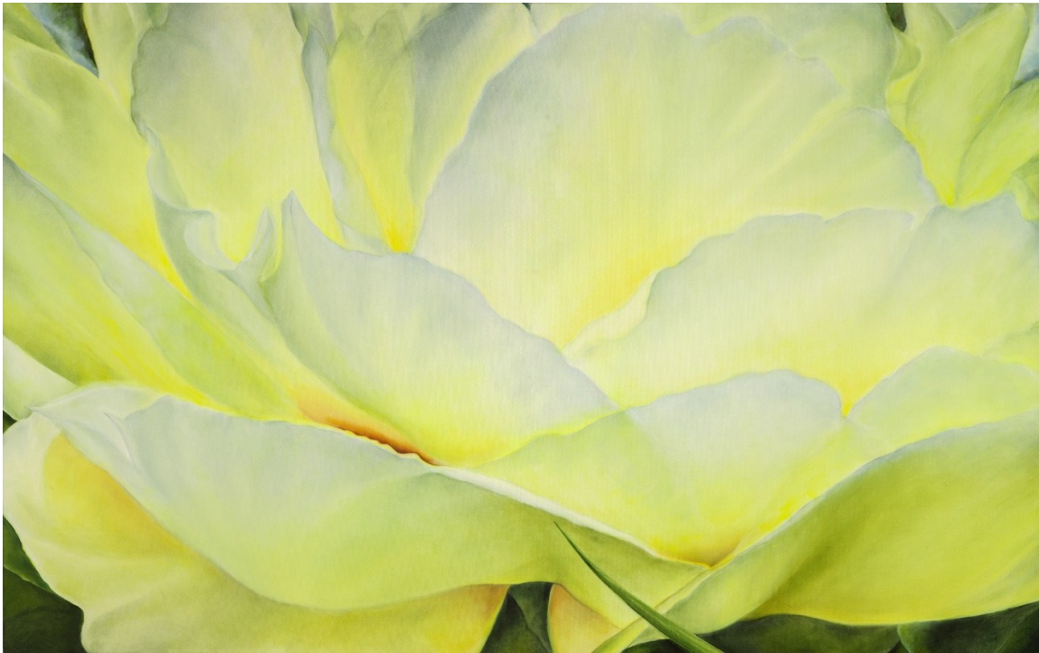
Lotus Peony/Meditation (Simpson Garden Park) ; $4,400 Oil on canvas; 30"H x 48"W; 2025