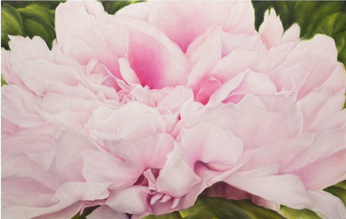
Pink Peony (Simpson Garden Park); $4,600