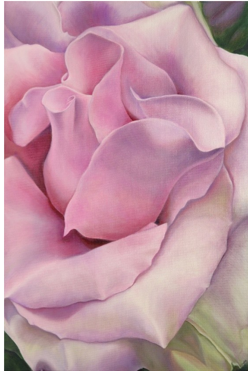
Pink Rose; $1,800 Oil on canvas; 30"H x 20"W; 2024