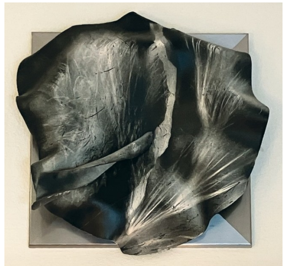
Maplethorpe ; $800 Ceramic, mounted on frame; 22"H x 22"W x 6"D; 2008