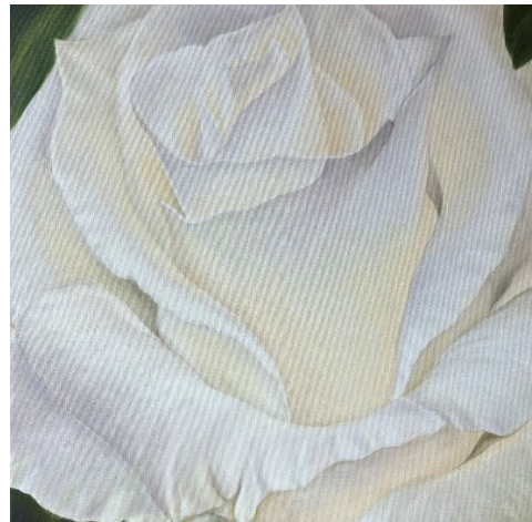
White Rose ; $1,950 Oil on canvas; 20"H x 20"W; 2024