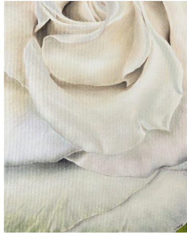
Bridal Rose; $1,600 Oil on canvas; 20"H x 16"W; 2024