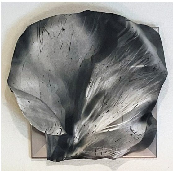
Dream, Walking Softly in the Night ; $800 Ceramic, mounted on frame; 19.5"H x 21.5"W x 5"D; 2008