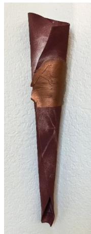
Quiver II; $175 Ceramic; 17.5"H x 3.25"W x 3.5"D; 2018