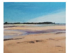
At the Bottom; $180 Sold Oil; 6”H x 7.25”W; 2025