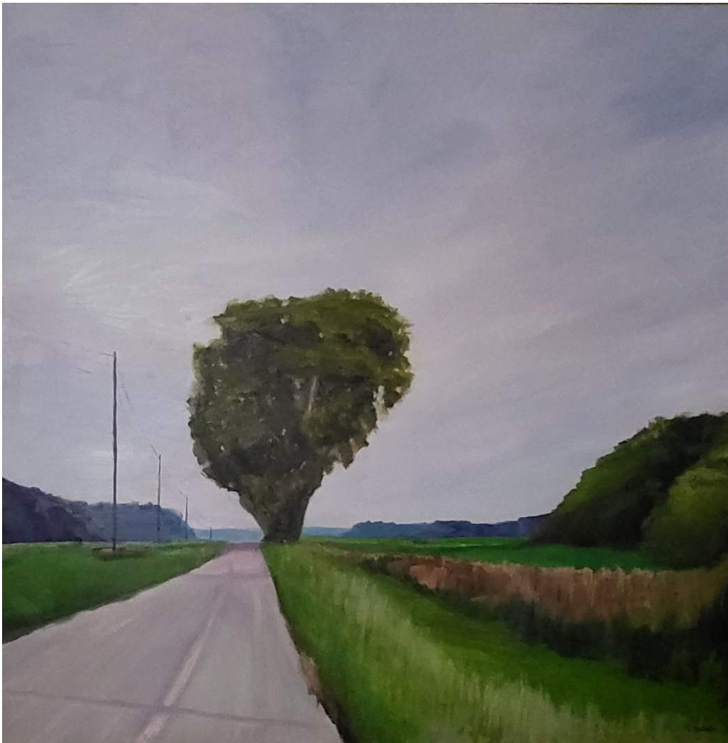
Just Past the Poplar; $1,080 Oil; 36”H x 36”W; 2024

“I remember when the blacktop was new. The long stretch by the back forty. They must have left some poplars stand. After the lines went in.”