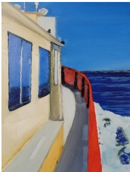
Charter; $315 Oil; 12”H x 9”W; 2024

Reserve artwork available for private viewing and immediate acquisition. Contact a Gallery Associate for details.