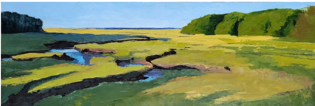
Saltwater Marsh; $720 Oil; 12”H x 36”W; 2024