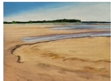
Seiche; $315 Oil; 9”H x 12”W; 2025