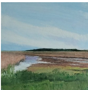
Among the Reeds and Grasses; $300 Oil; 10”H x 10”W; 2025

“Among the reeds and the grasses Waters swell Shallows drain Still.”