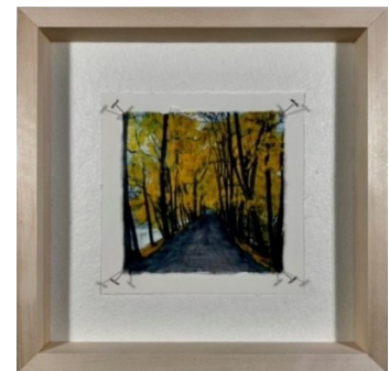
Towpath; $275 Hand-worked photographic monoprint on rice paper; 6.75”H x 6.75”W; 2025-2026