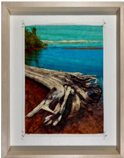
Superior Driftwood; $375 Sold Hand-worked photographic monoprint on rice paper; 15.5”H x 11.25”W; 2025-2026