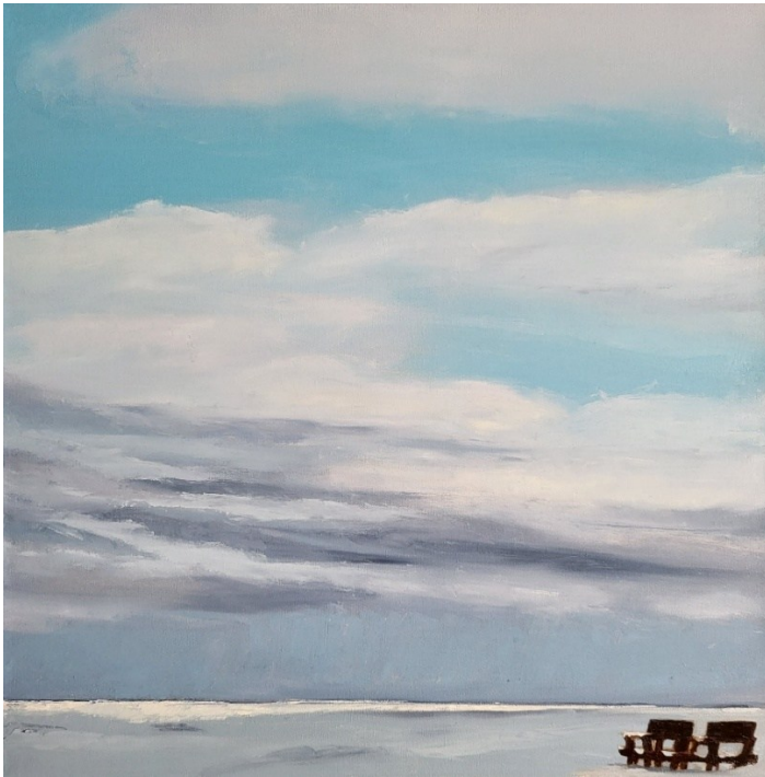
Superior Vacation; $720 Oil; 24”H x 24”W; 2026

“I just need you To look With me. There’s no end.”