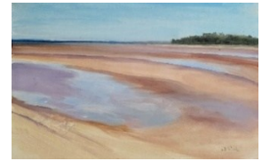
Reflections of What's Left; $210 Oil; 6”H x 8”W; 2025

“Among the reeds and the grasses Waters swell Shallows drain Still.”