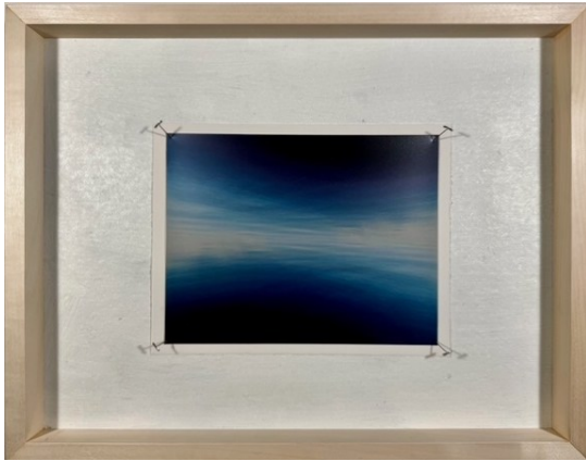
Superior Superior; $375 Sold Physically manipulated monoprint photo on acetate; 8.5”H x 11”W; 2025-2026