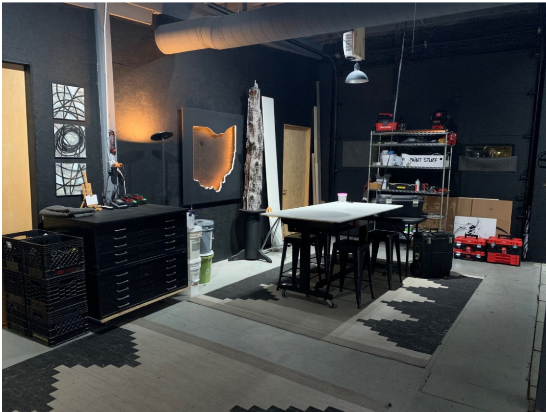
Jerry Gray's studio

Though the material components and methods of my work vary greatly the underlying intent remains. I am exploring and manipulating tangible bits of memories. Every image I depict and share are compositions of the malleability of memory. These compositions I have collected over the years of hiking, driving and simply exploring natural (often wild) beauty in places that both inspire me and remind of the contentment I rarely find. Not to only graciously memorialize, but to at times, manipulate them physically as our minds often do unconsciously.