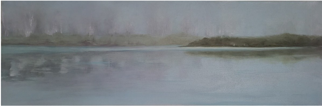
Deep Within; $720 Oil; 12”H x 36”W; 2025