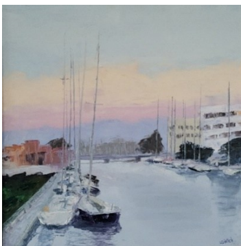
Black River Tension; $360 Sold Oil; 12”H x 12”W; 2023

“I remember when the blacktop was new. The long stretch by the back forty. They must have left some poplars stand. After the lines went in.”