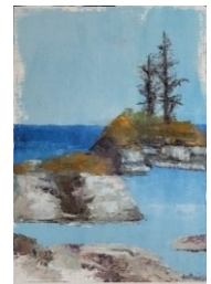
Still They Grow; $240 Sold Oil; 8”H x 5.5”W; 2025