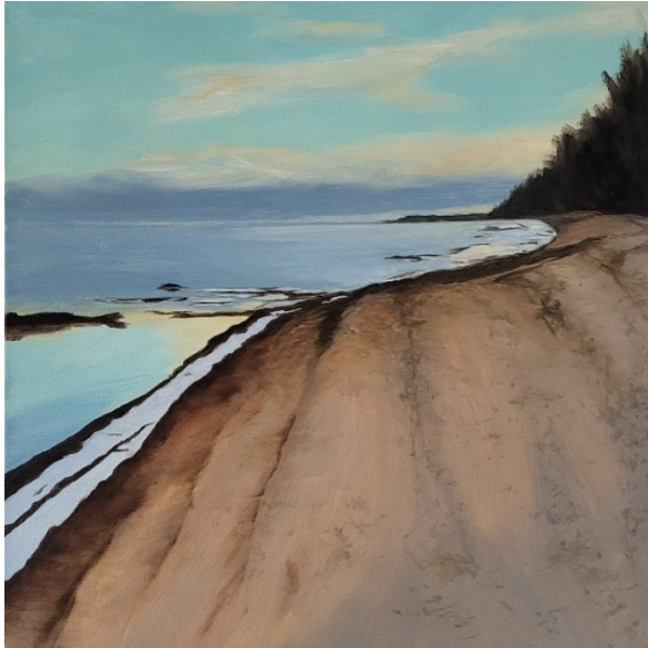
Winter Shoreline; $600 Oil; 20”H x 20”W; 2026

“But isn’t that a long ways away? It’s right outside. It’s always been.”