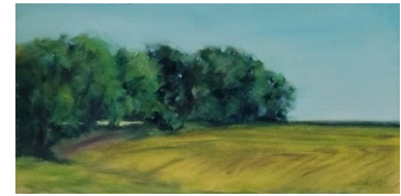
Patch of Field; $210 Sold Oil; 6”H x 8”W; 2025

“It’s hiding. Not in the rush of the fast river. Not in the swoon of the fat lake. But in the backwaters Is where we pause.”