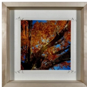
Gold Tree; $275 Physically manipulated monoprint photo on acetate; 8.5”H x 8.5”W; 2025-2026

Reserve artwork available for private viewing and immediate acquisition. Contact a Gallery Associate for details.