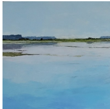
Backwaters; $360 Oil; 12”H x 12”W; 2023

“I just need you To look With me. There’s no end.”