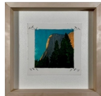
Yosemite Valley; $275 Hand-worked photographic monoprint on rice paper 6”H x 5.75”W; 2025-2026