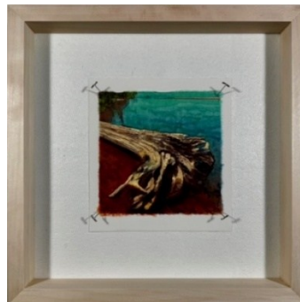
Superior Driftwood; $275 Hand-worked photographic monoprint on rice paper 6”H x 6”W; 2025-2026