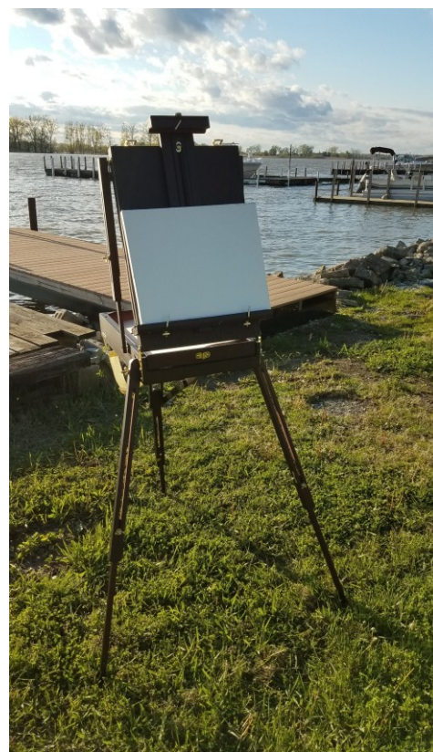
Leslie Dietsch's easel at her dock

I create these works with no plan for replication, ensuring that each painting remains as unique as the moment that inspired it. For me, landscape painting is an act of preservation. I aim to capture the fleeting rhythm of a tributary or the morning light through a grove before it shifts forever. This exhibition is an invitation to the viewer to slow down, to appreciate the value of the original, and to find their own story within these painted horizons.