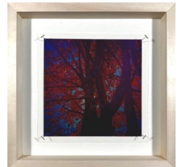
Red Tree; $275 Physically manipulated monoprint photo on acetate and paper; 8.5”H x 8.5”W; 2025-2026

“Memories are not set, they blanch, saturate, fracture and construct themselves over a lifetime. My imagery is not documentation but an evolving perspective of what and how I wish to share my particular lens.”