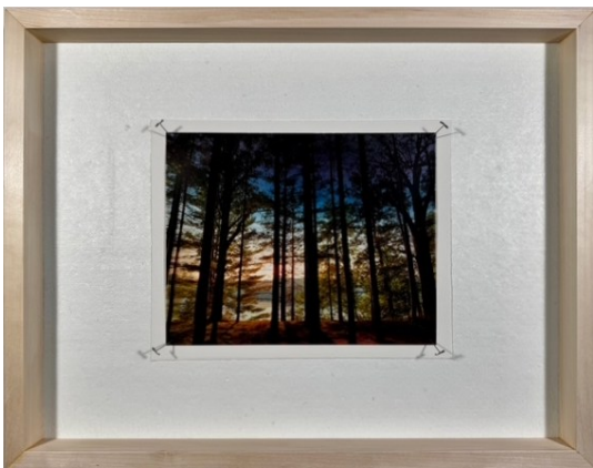
MI Treeline & Superior Shoreline; $375 Sold Physically manipulated monoprint photo on acetate; 8.5”H x 10.75”W; 2025-2026

Each of these moments can be directly related to where I was physically as well as the state of my being and the circumstances of my soul when I was there. Both what I was seeking and what I was leaving, are what these tokens are to me.”