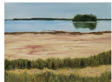
Island of Calm; $315 Oil; 9”H x 12”W; 2025