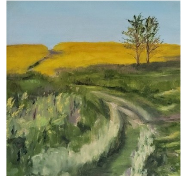
Behind the Stone Face; $360 Sold Oil; 12”H x 12”W; 2025