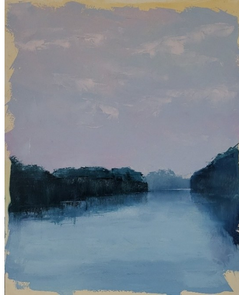
Beauty of the Overcast; $540 Oil; 20”H x 16”W; 2026

“But isn’t that a long ways away? It’s right outside. It’s always been.”