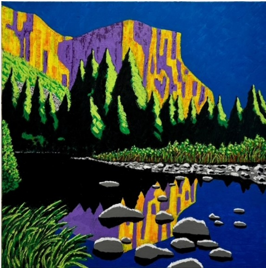
El Cap; $950 Acrylic on canvas; 36”H x 36”W; 2025-2026

“I believe these moments and locations I seek are what heaven is intrinsically made of.”