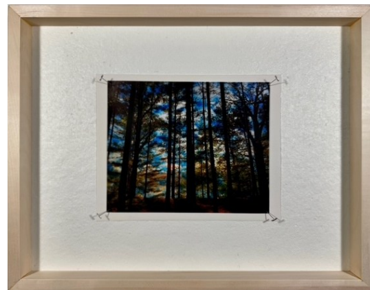
MI Treeline & Clouds; $375 Physically manipulated monoprint photo on acetate; 8.5”H x 10.5”W; 2025-2026