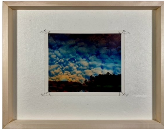
Inverse Shoreline & Clouds; $375 Physically manipulated monoprint photo on acetate 8.5”H x 10.5”W; 2025-2026