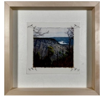
Linville Gorge; $275 Hand-worked photographic monoprint on rice paper; 6.25”H x 6.25”W; 2025-2026

Reserve artwork available for private viewing and immediate acquisition. Contact a Gallery Associate for details.