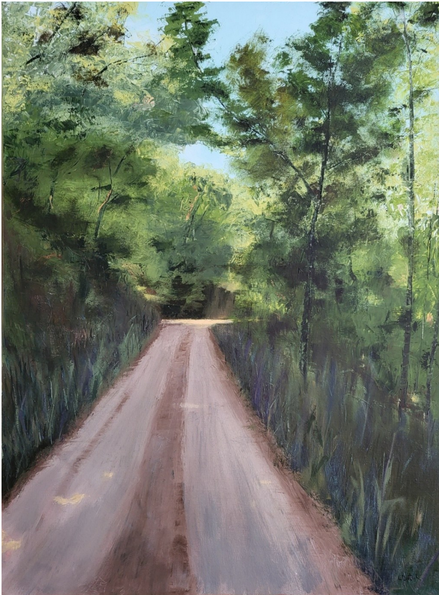
Pine Creek; $750 Oil; 40”H x 30”W; 2024

All work available for purchase. All artwork images provided by Leslie Dietsch. Dimensions reflect canvas size.