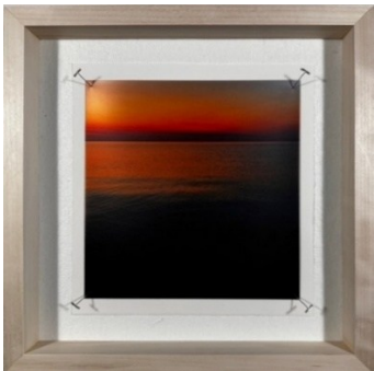
Sunset on Superior; $275 Physically manipulated monoprint photo on acetate; 8.5”H x 8.5”W; 2025-2026