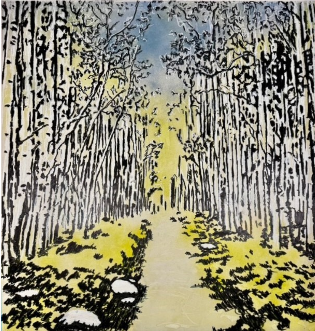
Colorado Trail; $500 Oil and aerosol on acetate sheets; 42.5”H x 42”W; 2025-2026

“By physically manipulating my digital imagery, I believe my hand/ body become an active participant in remembering.